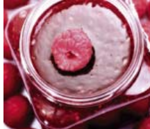
Food / Beverage