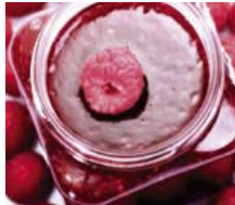
Food / Beverage