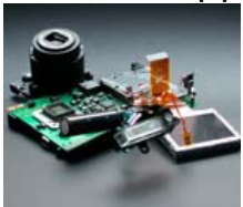
Electronics / Semiconductor Industry