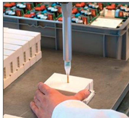
GURONIC customized potting