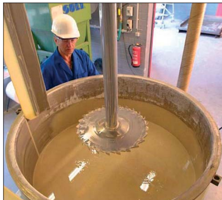
Potting resin production

Matronic AB a first choice partner when it comes to developing new materials and offering services tailored to your needs. You have not found the right material in our assortment? We also offer customized resin formulation and development services. Whatever your project may entail, we will provide the expert consulting you need to make it a success.