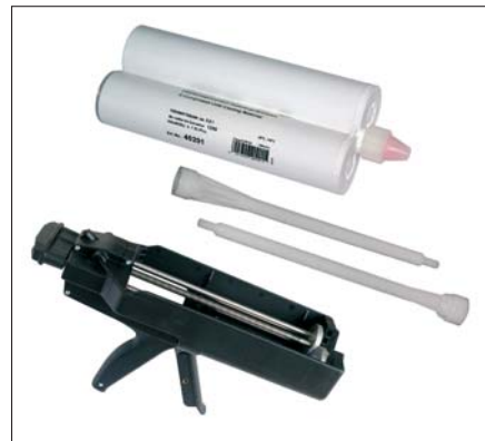
GURONIC C400-0 twin cartridge

Matronic AB a first choice partner when it comes to developing new materials and offering services tailored to your needs. You have not found the right material in our assortment? We also offer customized resin formulation and development services. Whatever your project may entail, we will provide the expert consulting you need to make it a success.